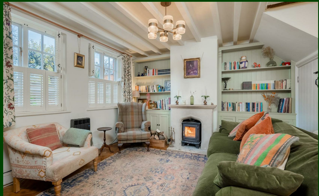
1 Church Street Charlbury Oxfordshire OX7 3PW Telephone: 01608 811146